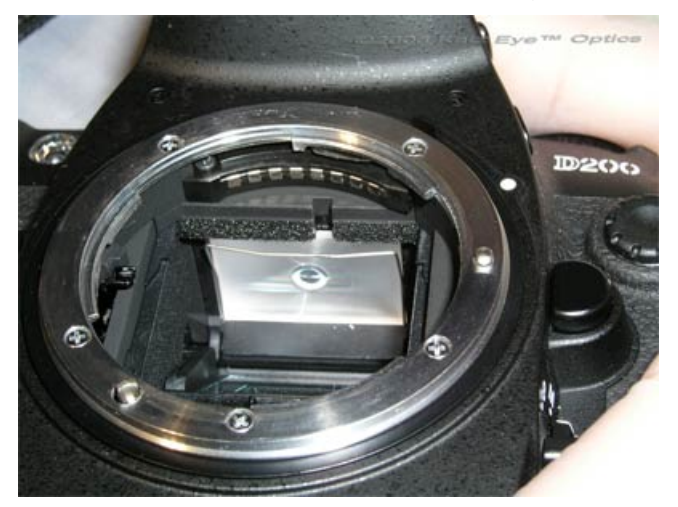
Fig. 9 - Click Photo to Enlarge

8. Lower the retaining wire until it approaches the catch. Gently press the wire toward the top of the camera (perpendicular to the focusing screen) and over the catch. It may be necessary to adjust the angle at which the pressure is applied in order to get the wire to catch – Figure 10 should provide a good starting point. If the wire springs back after pressing it all the way down, then try again with the pressure aimed slightly more toward the main mirror. Exercise great caution to insure that the tool does not slip from the wire and scratch the screen. Do not use excessive pressure – if the wire doesn't catch, stop, study the situation, and try again. Do NOT attempt to force it. When the wire is home, you should feel and/or hear a very slight click.