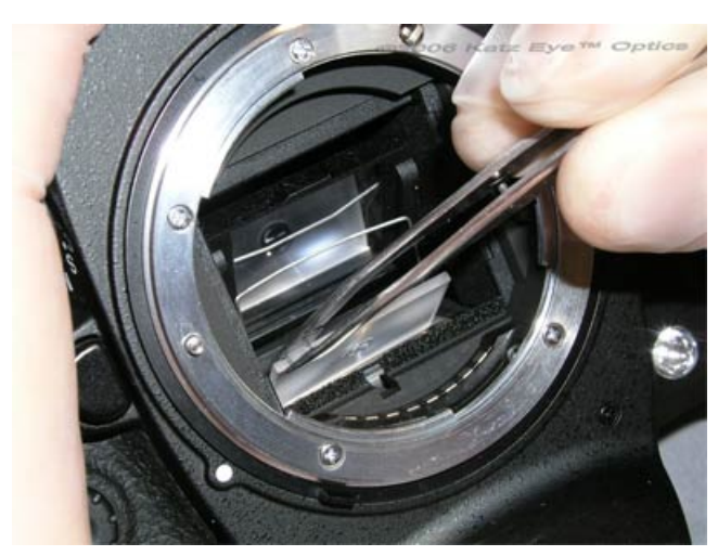
Fig. 8 - Click Photo to Enlarge

8. Lower the retaining wire until it approaches the catch. Gently press the wire toward the top of the camera (perpendicular to the focusing screen) and over the catch. It may be necessary to adjust the angle at which the pressure is applied in order to get the wire to catch – Figure 10 should provide a good starting point. If the wire springs back after pressing it all the way down, then try again with the pressure aimed slightly more toward the main mirror. Exercise great caution to insure that the tool does not slip from the wire and scratch the screen. Do not use excessive pressure – if the wire doesn't catch, stop, study the situation, and try again. Do NOT attempt to force it. When the wire is home, you should feel and/or hear a very slight click.