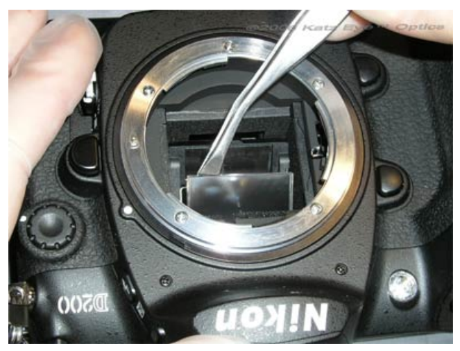
Fig. 6 - Click Photo to Enlarge