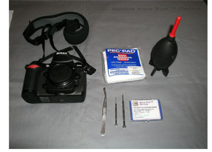
Fig. 1 – Click Photo to Enlarge