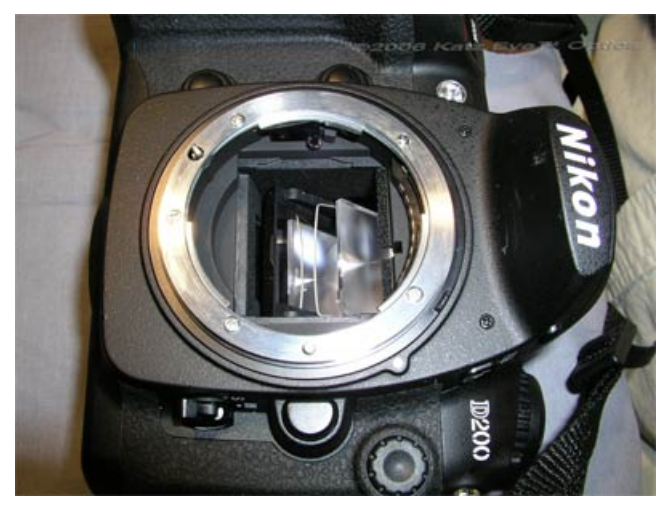
Fig. 5 - Click Photo to Enlarge

6. Continue pivoting the retaining wire away from the screen until it is nearly against the main mirror. Tip the camera so that the focusing screen falls against the retaining wire. Grasp the original focusing screen by the tab along the top edge. Be careful not to grasp too far down on the screen, as you could make marks in the viewable area. Carefully lift out the original focusing screen and store in a safe place. The shim(s) should not be removed – if the shim(s) are accidentally removed with the focusing screen (static often holds them together), reinsert the shim(s) before continuing.