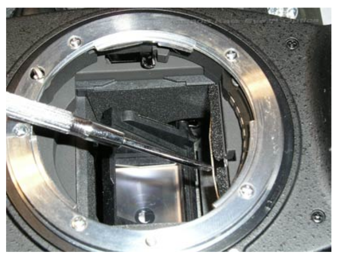
Fig. 10 - Click Photo to Enlarge