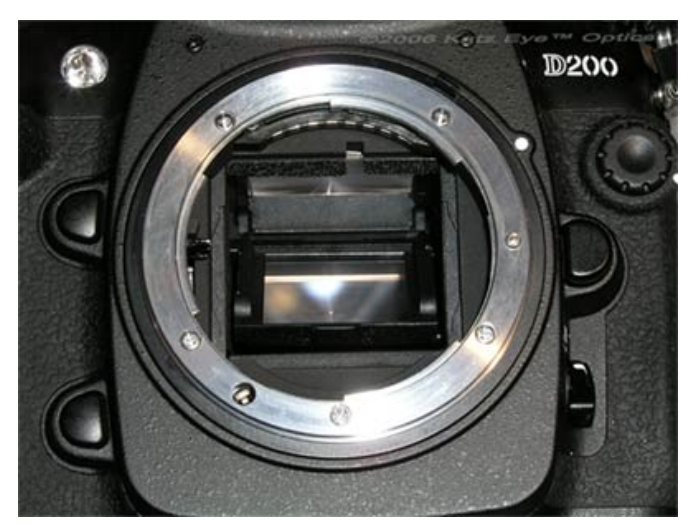
Fig. 2 - Click Photo to Enlarge